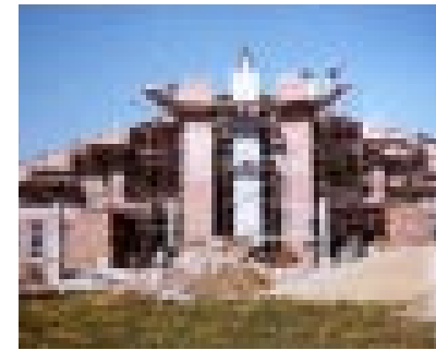
Church Under Construction - 1962

By now, you have had the opportunity to read The La Salette News and know that our parish goals are: