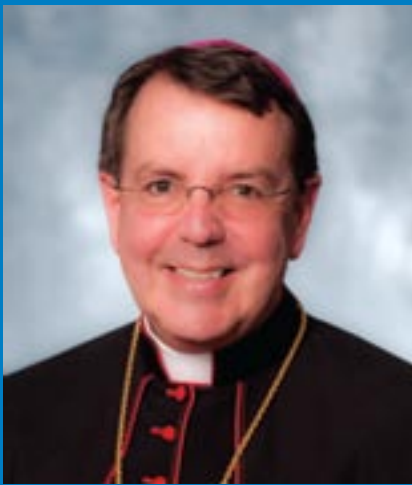
A Message from Archbishop Vigneron